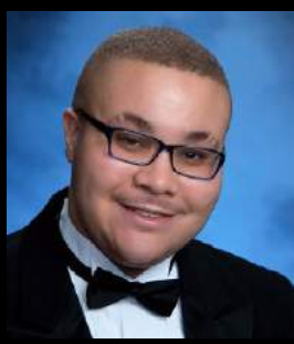
Jordan Jefferson State Community College